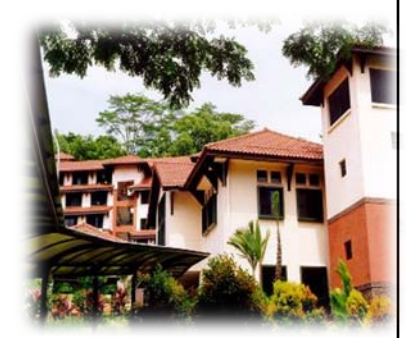
Hall of Residences

Is on-campus accommodation available to exchange students?